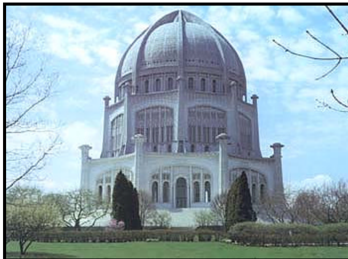
The House of Worship of the Bahá'í Faith in North America, located in Wilmette, Illinois. To see the House of Worship Live on the Internet , visit: http://www.us.bahai.org